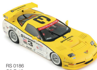
RS 0186 C5-R #3 24h Daytona 2000 R.Fellow - C.Kneifel - J.Bell