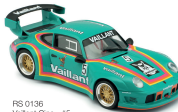
RS 0136 Vaillant Cina - #5