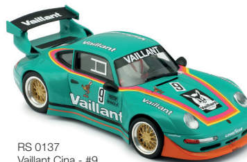
RS 0137 Vaillant Cina - #9